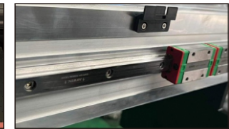
2.0 THK guide